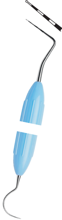
Explorer - Probe 2 LM 23-520B XSI VET