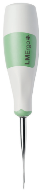
Root Luxating LM 812210 VET

Root luxating instrument is designed for delicate root teasing procedures.