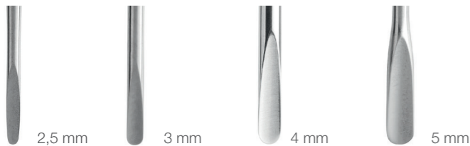
Luxating 2 LM 812220 VET

Luxating instruments are available in four different blade sizes.