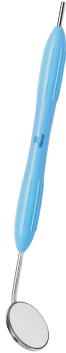
Mirror handle LM 25 XSI VET

Explorer probes are diagnostic combination instruments for detecting calculus, cavities and abnormalities on the tooth surface as well as measuring the pocket depths. Color coded markings on the probes indicate the depth/measure in millimeters of the periodontal pocket. Ball end does not harm gum tissue or damage pocket bottom.